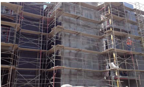
WNC relies upon heavy plastic and stucco tapes to protect surfaces as plaster is messy and can cause damage.

“When we start a job, we make sure to mask the windows, sheet metal and any other surface that needs protection,” explained Coffman. “Plaster is such a messy trade. It can damage lots of things.”